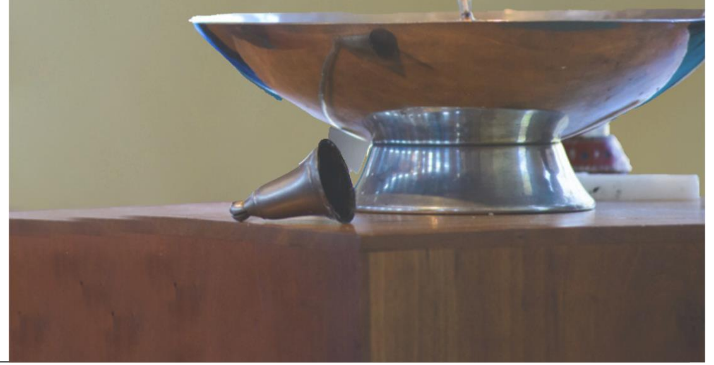
Starting Point – Participant Guide - 4 Sessions

The Unitarian Universalist Journey and The Journey of Our Church